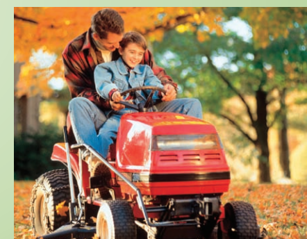
Lawn and Garden