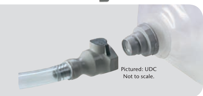
Pictured: UDC Not to scale.

Flexible Packaging: Provide closed connection to bag-in-box chemical packaging; insert/cap with connector body Material (Puncture Seal): Polyethylene (LDPE) and polypropylene Termination Sizes: 1/4" - 3/8" hose barb - cap fits 38mm bag-in-box thread-on spout Feature: Puncture seal coupling