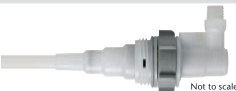
Not to scale.

DrumQuik® PRO: Secure, easy-to-use connection to acid or bicarbonate concentrate and sanitizer drums Material: Food grade, virgin polypropylene and polyethylene Termination Sizes: 3/8" – 3/4" hose barb, 1/2" NPT or 3/4" BSPP. Fits 2" buttress or BCS 56x4 threaded drum bungs. Feature: Integrated dip-tube and drum closure